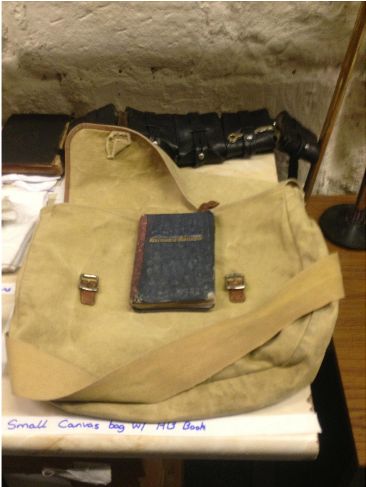
Small Canvas bag w/ HB Book