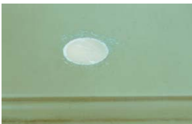
Pictured from top to bottom, is the pull-off adhesion testing. First, scuff the surface prior to pull-off testing. Next, glue the adhesion dollie to the finish film. Then, score through the adhesive and the finish. Using a hydraulic test apparatus, apply pull-off pressure to dollie. Finally, the finish disbands from the test area.

to detach the coating in a direction perpendicular to the substrate. To perform this test we used a DeFelsko Positest Adhesion Tester, following ASTM D4541 to perform this test. A metal loading dolly is secured perpendicular to the surface of the dry coating film by means of a CA (cyanoacrylate or “super glue”) adhesive or the adhesive supplied by the manufacture.