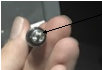
Needle soldered in place